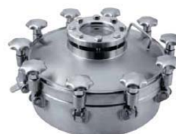
D13 - PED Certified